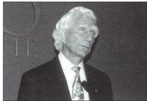
Postmaster General Marvin Runyon told a Cato conference that the U.S. Postal Service needs modern management, not privatization.