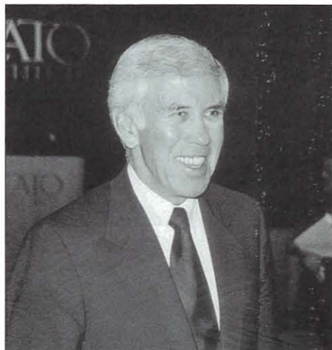
Sen. Richard Lugar used the Cato Institute on April 5 as the setting to announce his plan to replace the income tax with a national sales tax.

With savings and investments no longer taxed, Americans will enjoy a capital for-