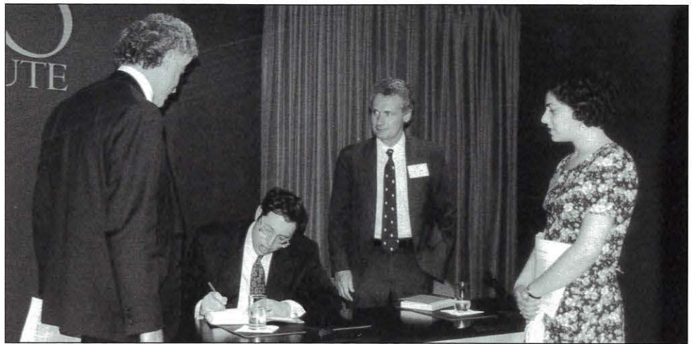
Cato adjunct scholar Richard Epstein, author of Simple Rules for a Complex World , signs copies of his book after a Cato Policy Forum.