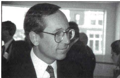
José Piñera, who privatized the Chilean social security system, discussed that success at a Cato Policy Forum.