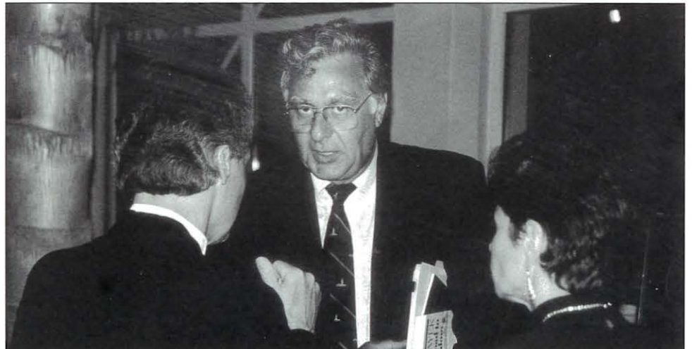
Rep. Dick Armey (R-Tex.), Majority Leader of the House of Representatives, delivered these remarks at the dedication of the Cato Institute's F. A. Hayek Auditorium on May 9, 1995.

True to our word, and despite the skeptics, we've produced a specific, detailed plan to balance the budget in seven years. And we get there with real spending cuts. No accounting gimmicks. No tax increases. In Hayekian fashion, we asked basic questions: Does the typical American family really need a Department of Commerce? Could our children learn without an Education Department? Could the Republic survive without a National Endowment for the Arts? Would the economy grind to a halt without an Interstate Commerce Commission?