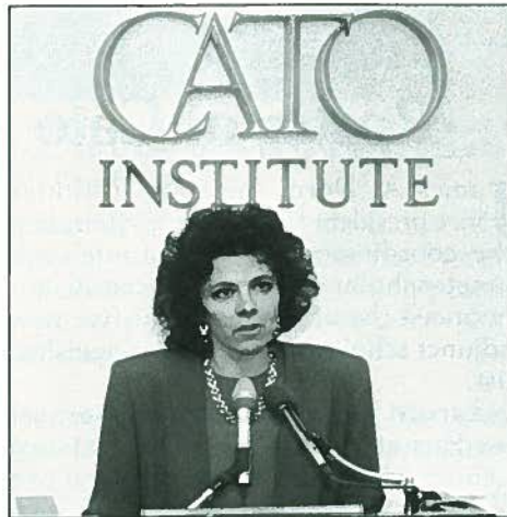
Nadine Strossen: "To think that granting the 'oppressive' power structure the additional power to sanction certain speech is somehow going to improve the lot of the oppressed strikes me as politically naive."

That is not a position that just the ACLU and the Cato Institute have advocated; it is a position that has been accepted by the entire spectrum of Supreme Court justices from left to right, from conservative to liberal, or however you want to describe them. I think that is striking when we look at a Court that now is so divided on so many issues. I mean, how many decisions are five to four with fragmentary opinions within them? First Amendment protection for offensive or hateful speech is