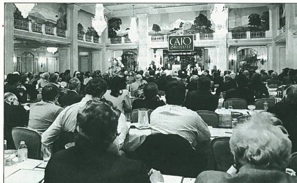
More than 300 people gathered on January 8 for Cato's conference "America in the Gulf."

Published by the Cato Institute, Cato Policy Report is a bimonthly review. It is indexed in PAIS Bulletin .