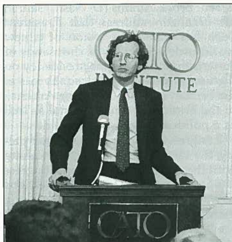
White House aide James P. Pinkerton calls for a "new paradigm" of choice and decentralization at a Cato Forum.

January 22: James P. Pinkerton, a domestic adviser in the White House, discussed his ideas for "America's New Paradigm" at a Cato Policy Forum. Pinkerton called for an entrepreneurial approach to government—elimination of monopoly bureaucracies, reliance on the forces of the free market, and recognition of people's right to educate their children where they choose and