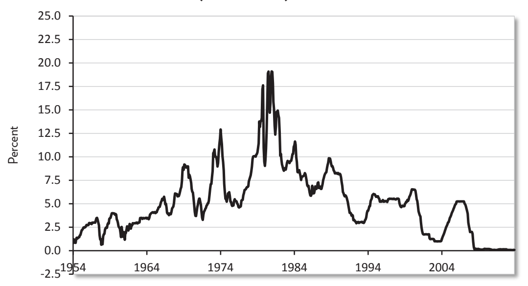
Figure 1 Effective Federal Funds Rate (FEDFUNDS)