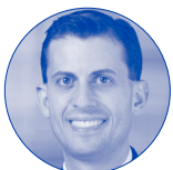
ALEX NOWRASTEH is the vice president for economic and social policy studies at the Cato Institute.

The federal government has an important role in screening all foreigners who enter the United States and excluding those who pose a threat to the national security, safety, or health of Americans, as foreign-born terrorists explicitly do. This focused terrorism risk analysis can aid in the efficient allocation of scarce government-security resources to best counter the small threat of foreign-born terrorists.