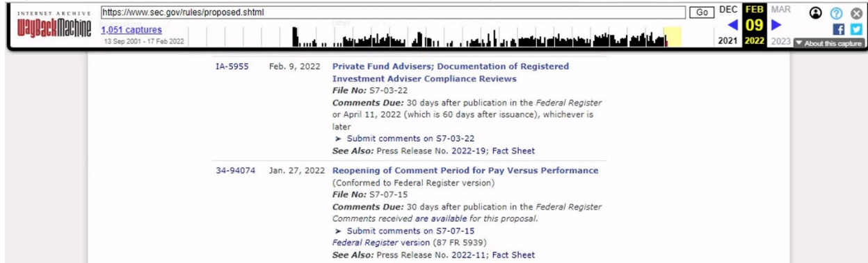
Figure 3: Screenshot of the SEC’s proposed rules on February 9, 2022.

Source: The Internet Archive’s Wayback Machine 17