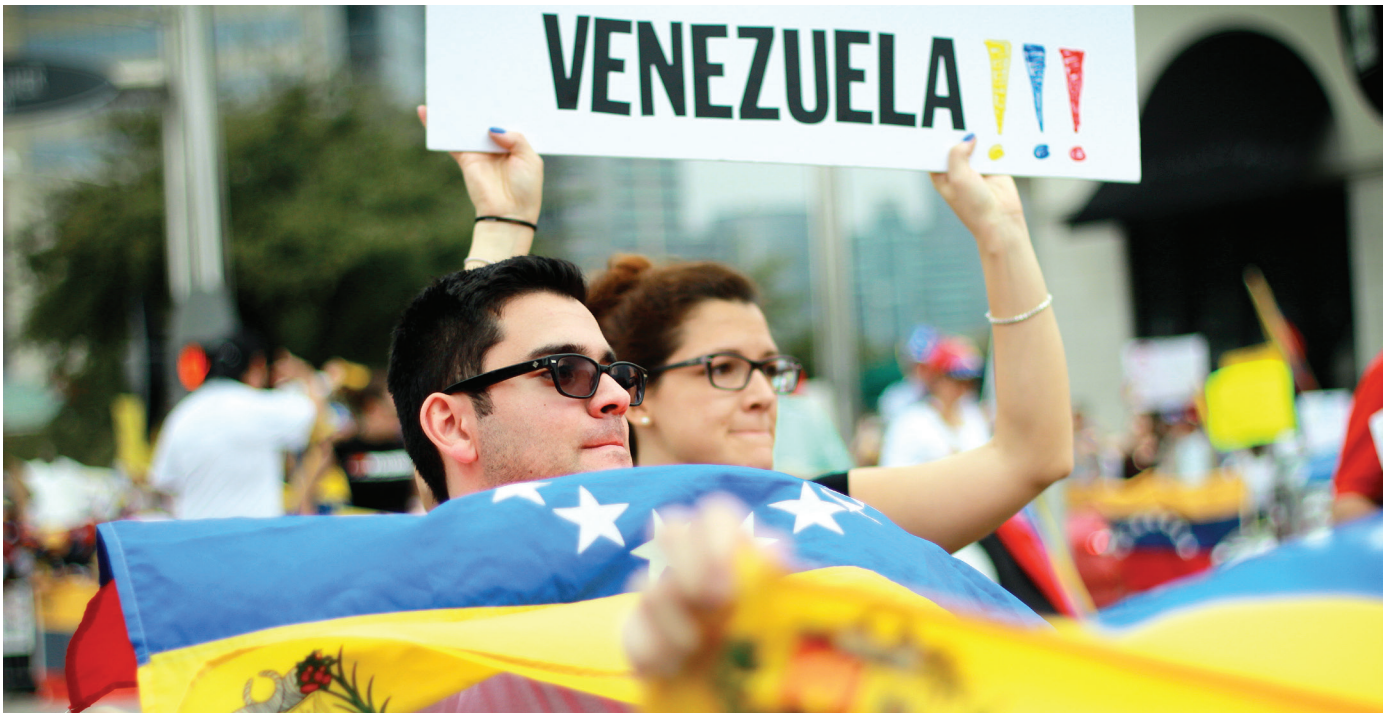
Venezuelan citizens in Houston protest against the regime of President Nicolás Maduro.

an exchange rate policy (the exchange rate is fixed) but no monetary policy. A currency board's operations are passive and automatic. The sole function of a currency board is to exchange the domestic currency it issues for an anchor currency at a fixed rate. Consequently, the quantity of domestic currency in circulation is determined solely by market forces, namely the demand for domestic currency.