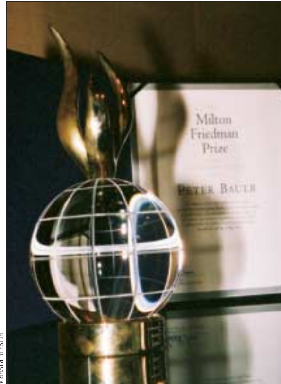
Along with a cash prize of $500,000, the Milton Friedman Prize includes a framed certificate and a metal-and-glass sculpture of the flame of liberty atop the globe.