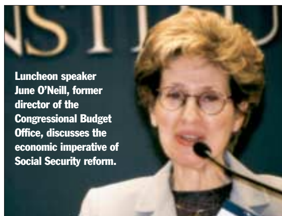
Luncheon speaker June O'Neill, former director of the Congressional Budget Office, discusses the economic imperative of Social Security reform.