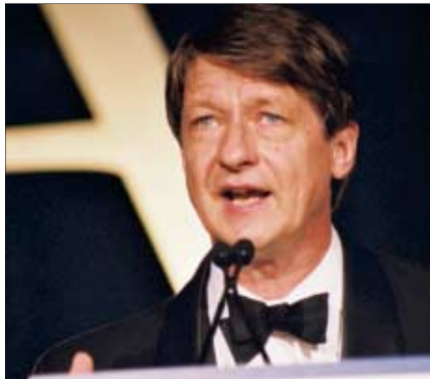
P. J. O’Rourke, best-selling author and Cato Mencken Research Fellow, addresses the guests at Cato’s 25th Anniversary dinner.

But it’s common sense, really, more than common selfishness, that drives the libertarian philosophy. We hold the individual to be self-evident. We believe in the pri-