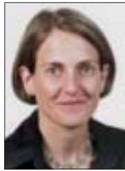
Veronique de Rugy

According to Cato policy analysts Veronique de Rugy and Charles V. Peña, the CDC strategy of “ring containment,” which entails inoculating only