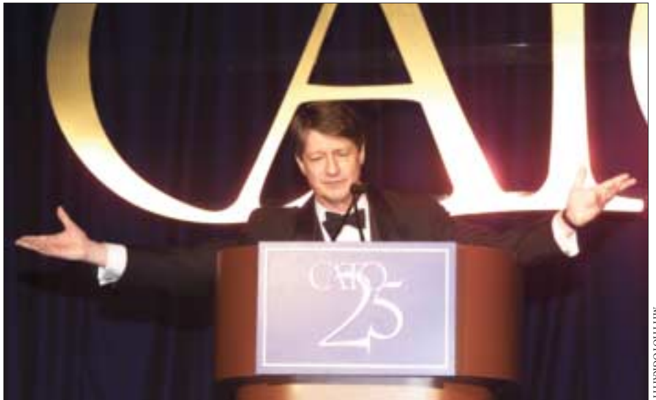
P. J. O'Rourke: "Two of the most ingrained ideas in the human mind are the idea of collective entitlement and the idea of zero-sum outcomes."

Notice how the idea of collective entitlement is much more popular than the idea of collective forfeiture. Very, very rarely does somebody volunteer to go to jail because