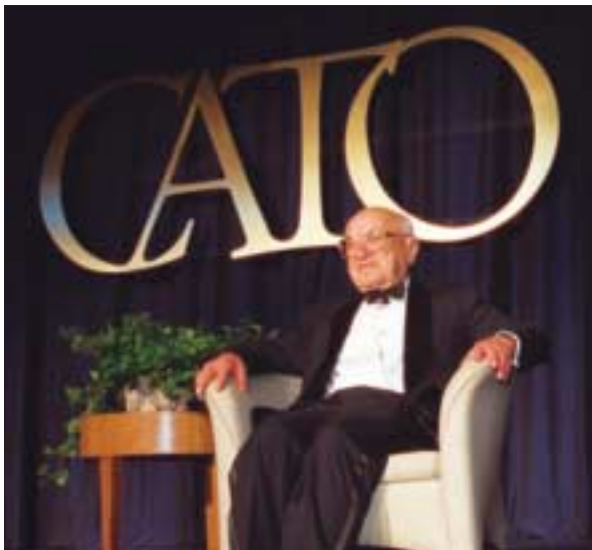
Milton Friedman on stage for the presentation of the Milton Friedman Prize for Advancing Liberty at the Cato Institute's 25th Anniversary dinner.

So today, Milton, as we say when we are visiting our troops around the world—the men and women who defend what you have helped to build—thank you for what you do for our country. ■