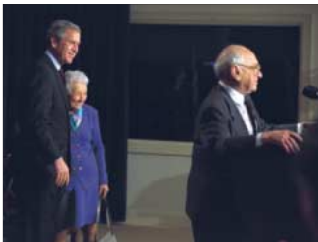
President Bush and Rose Friedman listen as Milton Friedman addresses the audience at the White House ceremony in his honor.

We have seen Milton Friedman's ideas at work in Chile, where a group of econ-