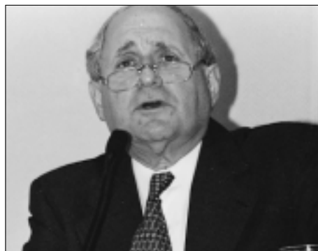
Sen. Carl Levin (D-Mich.) contended that to be considered effective, NMD must have a "reasonable chance" of being able to hit incoming missiles.

Sen. Jon Kyl (R-Ariz.), a staunch NMD advocate and a member of the Select Committee on Intelligence, warned against oppos-