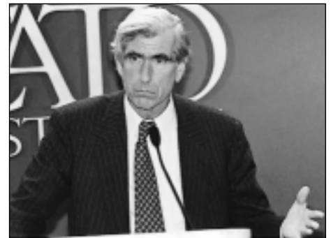
C. Boyden Gray, former Bush White House counsel