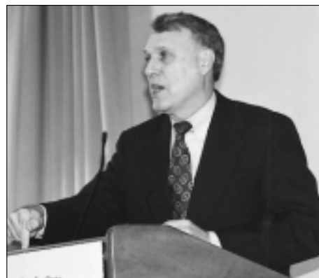
Sen. Jon Kyl (R-Ariz.) warned against opposing NMD because of a recent easing of tensions on the Korean peninsula.

not work from day one in the year 2005 when it is supposed to be deployed with 20 interceptors, and by 2007 with 100 inter-