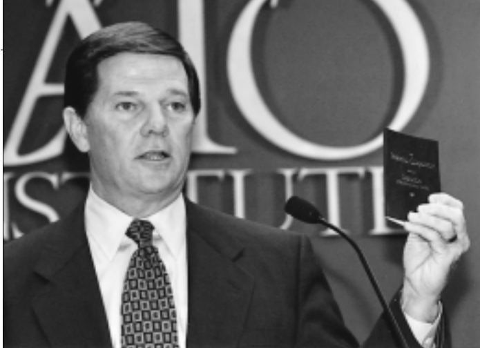
At a Cato Policy Forum on campaign finance reform, House Majority Whip Tom DeLay (R-Tex.) holds up a copy of the U.S. Constitution printed by the Cato Institute.