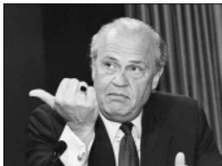
Sen. Fred Thompson (R-Tenn.)

On July 8, 1997, the Senate Committee on Governmental Affairs, which I chair, began hearings on the 1996 presidential