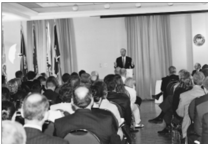
Sen. Joseph Biden (D-Del.) advised President Clinton to leave the decision on NMD to his successor.

The conference, which was cosponsored by the Cato Institute, the Council for a Livable World Education Fund, and the National Defense University Foundation, can be viewed with RealPlayer on Cato's Web site, www.cato.org .