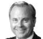
Thomas F. McLarty III Vice Chairman, Kissinger McLarty Assoc.